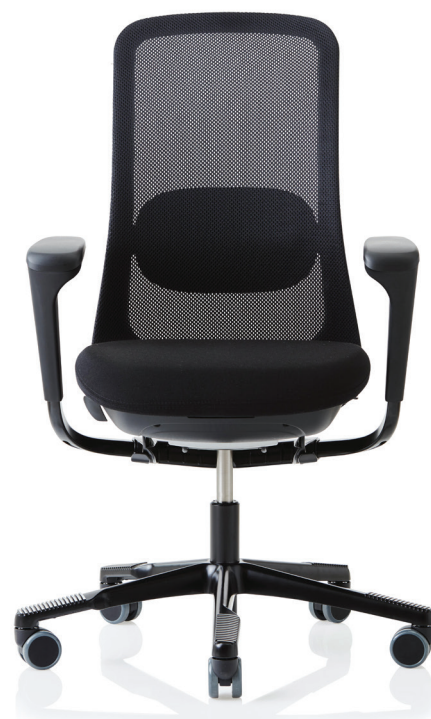
Design: Frost Produkt AS, Powerdesign AS and Flokk Design Team Patent- and design protected