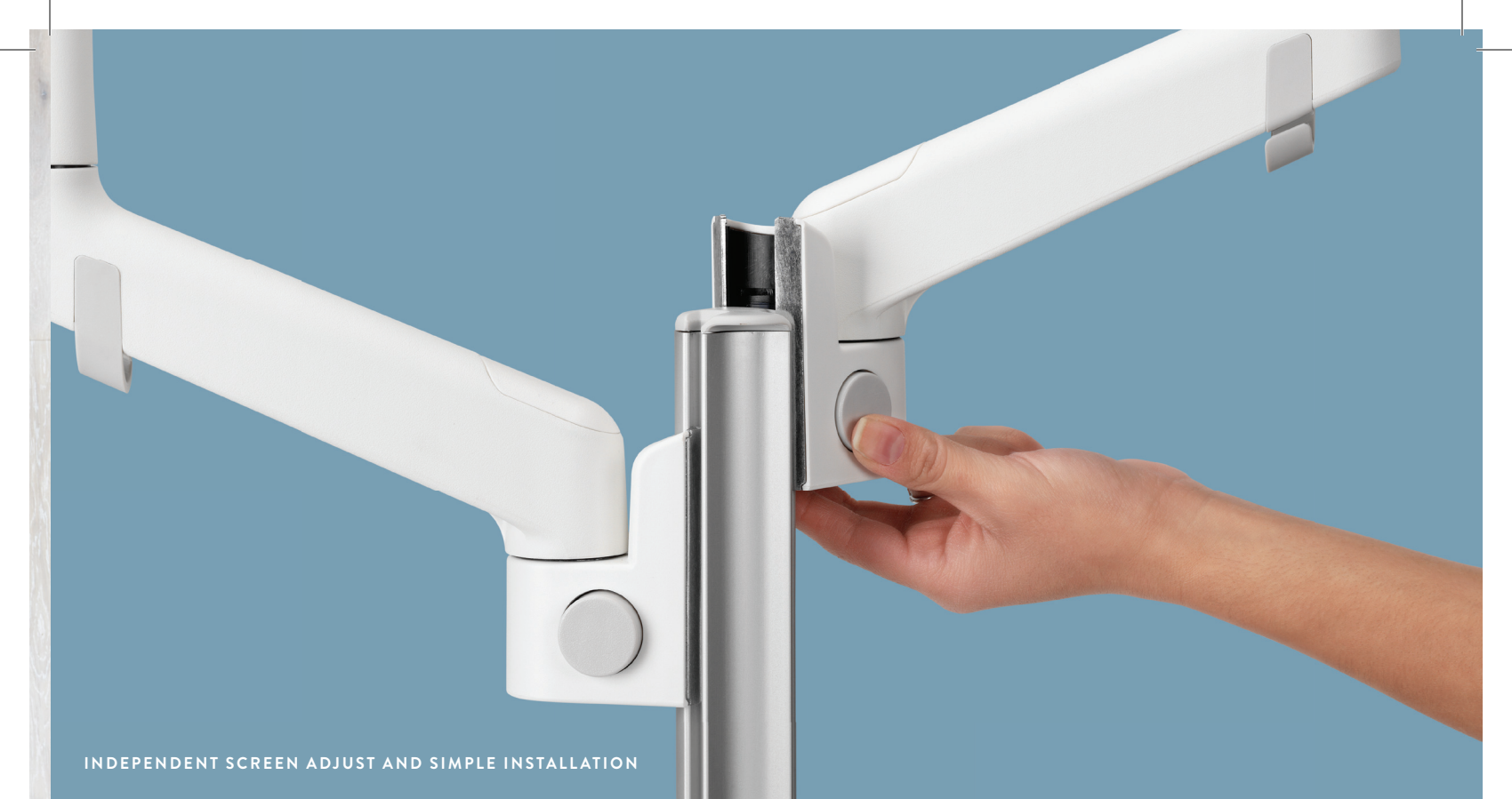
INDEPENDENT SCREEN ADJUST AND SIMPLE INSTALLATION