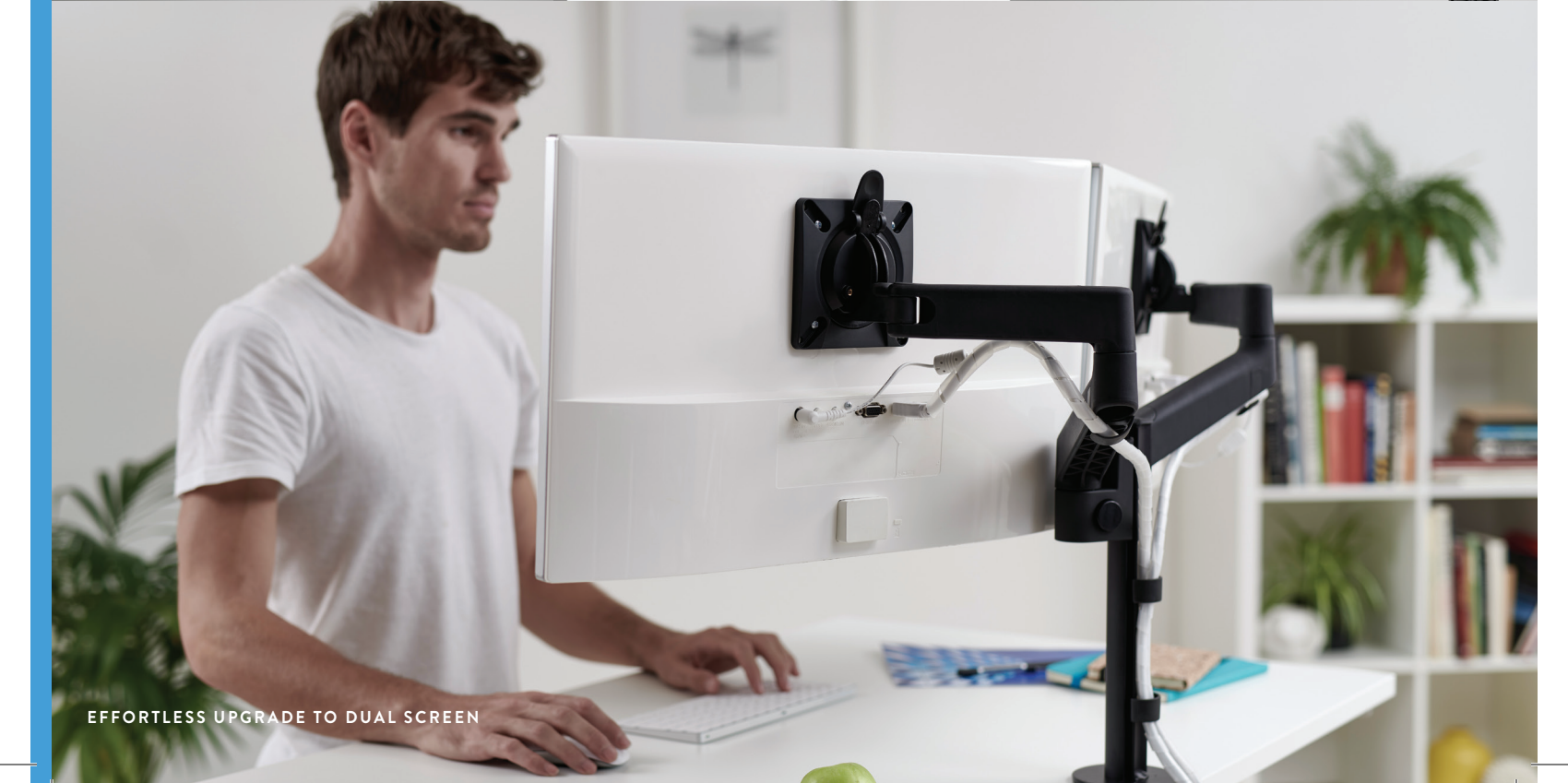
EFFORTLESS UPGRADE TO DUAL SCREEN