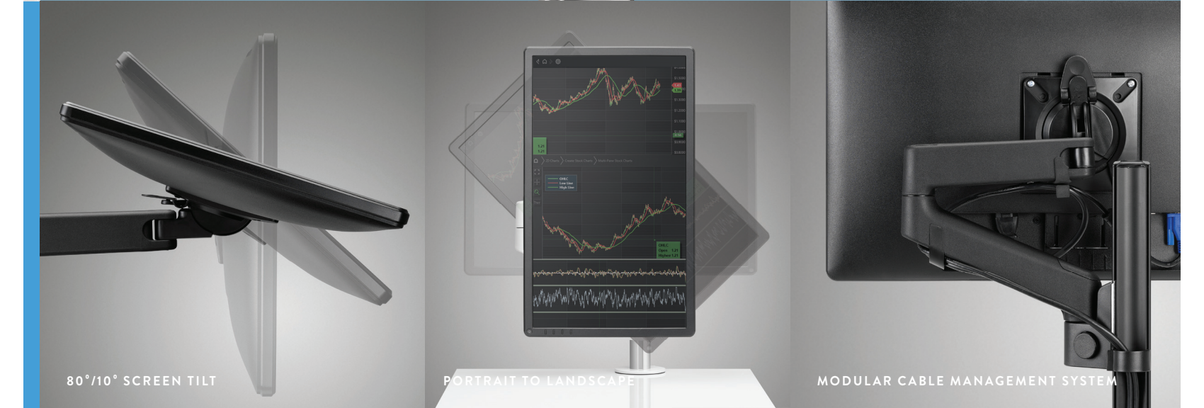
80°/10° SCREEN TILT